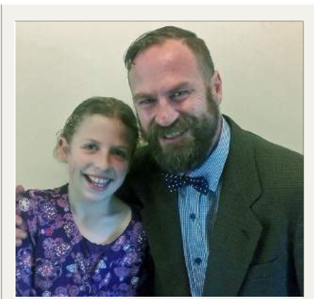
We were overwhelmed by the support for the Cure4CF Father's Day Appeal.