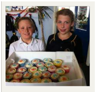
Baking cupcakes to help find a cure for CF!