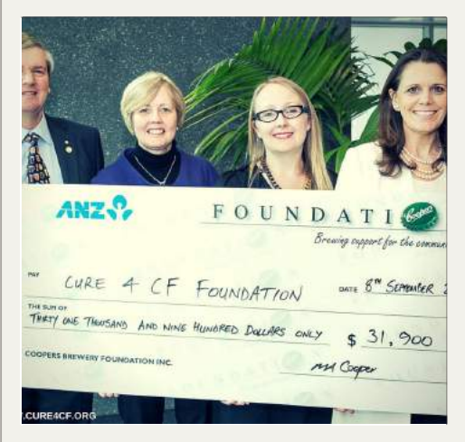
The Coopers Brewery Foundation donates $31,900 to support a cure for cystic fibrosis airway disease.