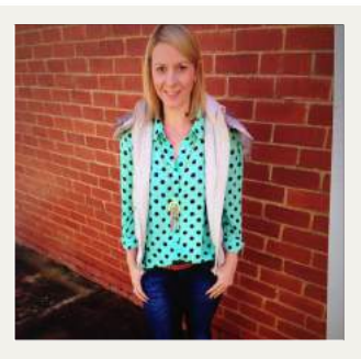
Peta took us a step closer to a cure in the Bay-City.